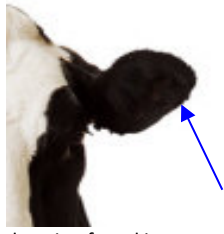
Figure 5: Best location for taking ear notch