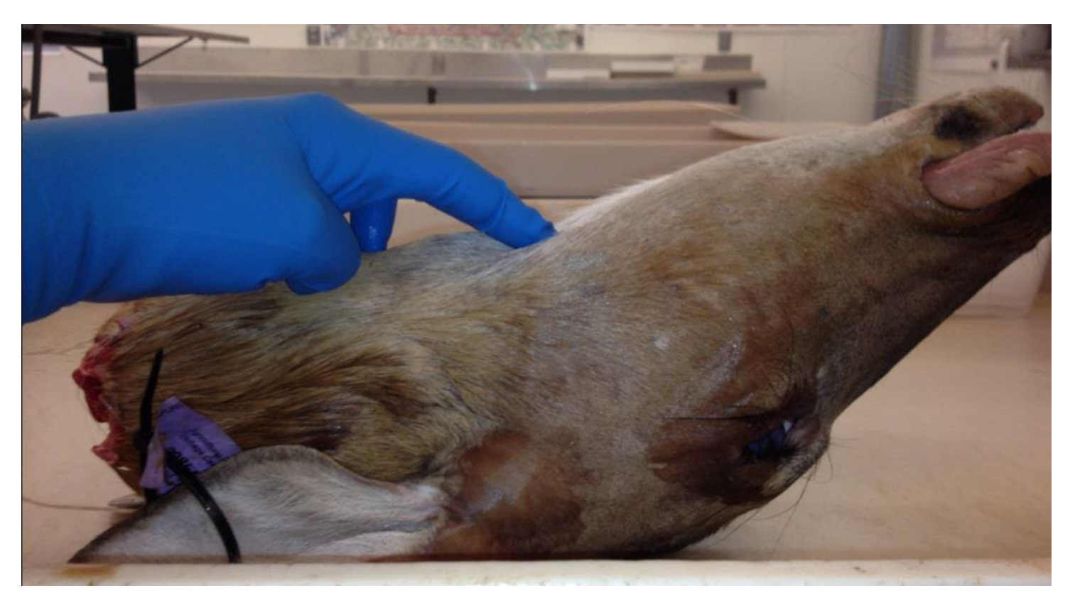
Step 1. Locate the larynx approximately where the neck bends.